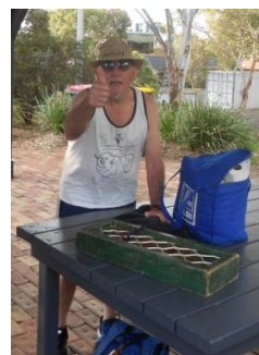
Six - 35